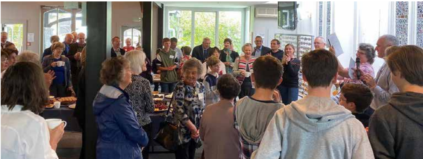
'Thank You' Morning Tea - There are many people who contribute to the life of the Parish and our ministries. This morning tea was to thank our many volunteers for their time, effort and skills.