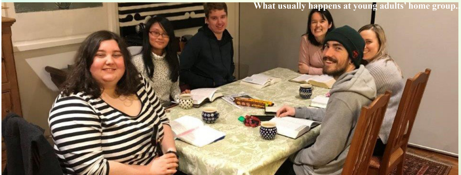
What usually happens at young adults' home group.