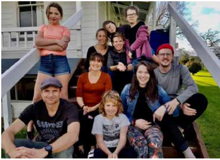
The Loyal Workshop Kolkata crew at Peacemakers in Helensville

Lockdown also gave us time to do some work on our house. Our garden is looking significantly less jungle-ish, we repaired and painted our roof and prepped and painted a bedroom.