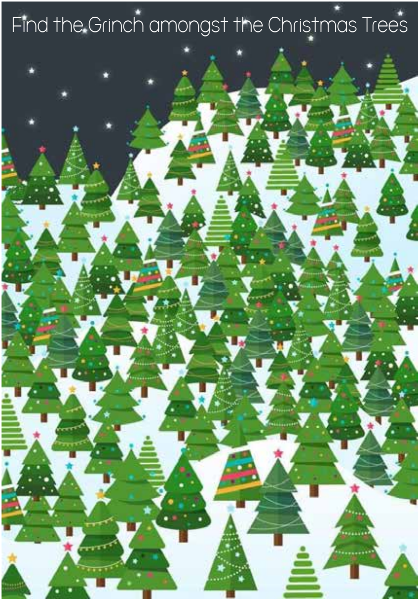
Find the Grinch amongst the Christmas Trees

ANGELS BETHLEHEM BIRTH CAESAR AUGUSTUS CENSUS CITY OF DAVID FLOCKS FRANKINCENCE GALILEE GABRIEL GLORY TO GOD GOLD GOOD WILL GOSPEL HEROD HOPE HOST IMMANUEL INN JESUS JEWS JOSEPH JOY LIGHT LUKE LOVE MANGER MAGI MARY MESSIAH MIRACLE MYRRH PEACE ROOM SHEPHERDS SON STABLE STAR SWADDLE TAX WISE MEN