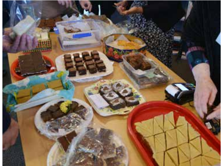
Entries for the annual Bake-off.