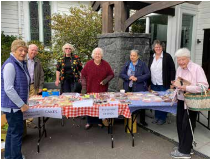
Election Day cake stall.