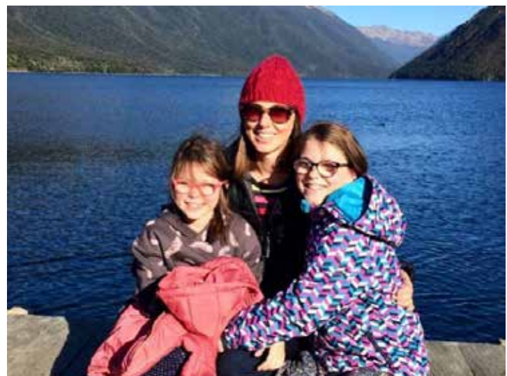
Midwinter at Lake Rotoiti

Our sending organisation have done a fabulous job looking after us these past months. We are usually so far from the NZ staff and our colleagues around the world, and it's been lovely getting to know them better. During lockdown, we joined an initiative called Happy Hour. Every week people tuned into a ZOOM meeting that featured a panel of interesting people working around the globe. Happy Hour addressed a bunch of really interesting themes, and we were asked to be on the panel several times. Plenty of curly questions were asked, beverages were consumed, and many LOLs were had.