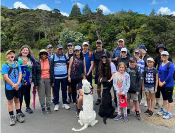
Hike to Huia early in November.