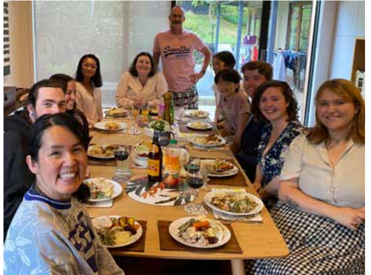
Young Adults Home Group Thanksgiving Dinner.